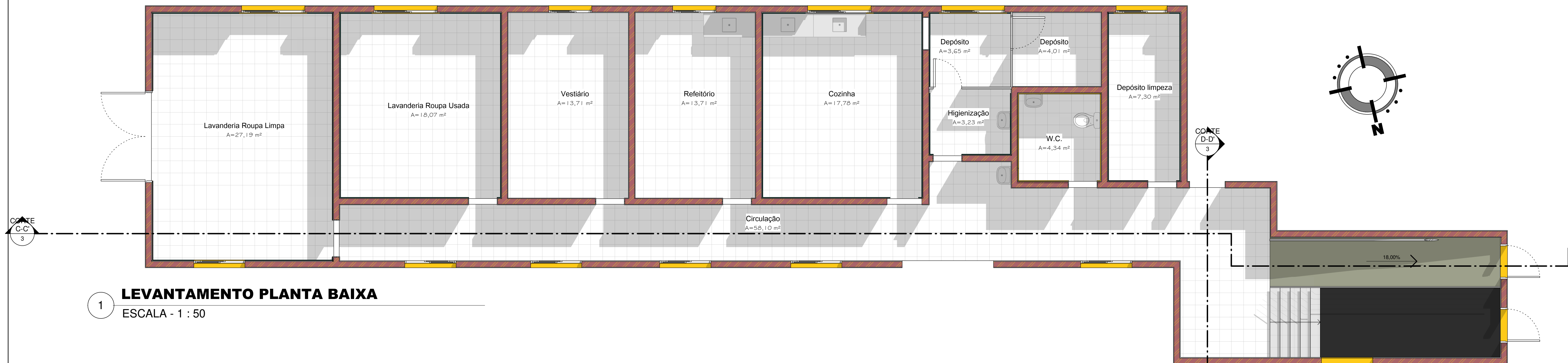
1 LEVANTAMENTO PLANTA BAIXA ESCALA - 1 : 50